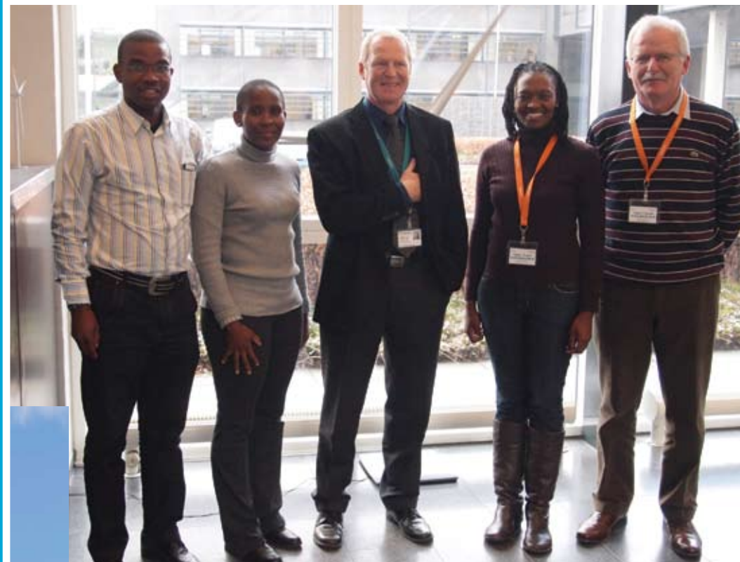
Pictured are representatives from Usizo Engineering, Enzani Technologies and Mainstream visiting Siemens head office in Denmark.

This will contribute significantly to developing local talent and addressing the shortage of engineering skills in South Africa. As these companies develop new skills, and as the renewable sector expands, they will look to expand their companies and in doing so, will create new jobs.